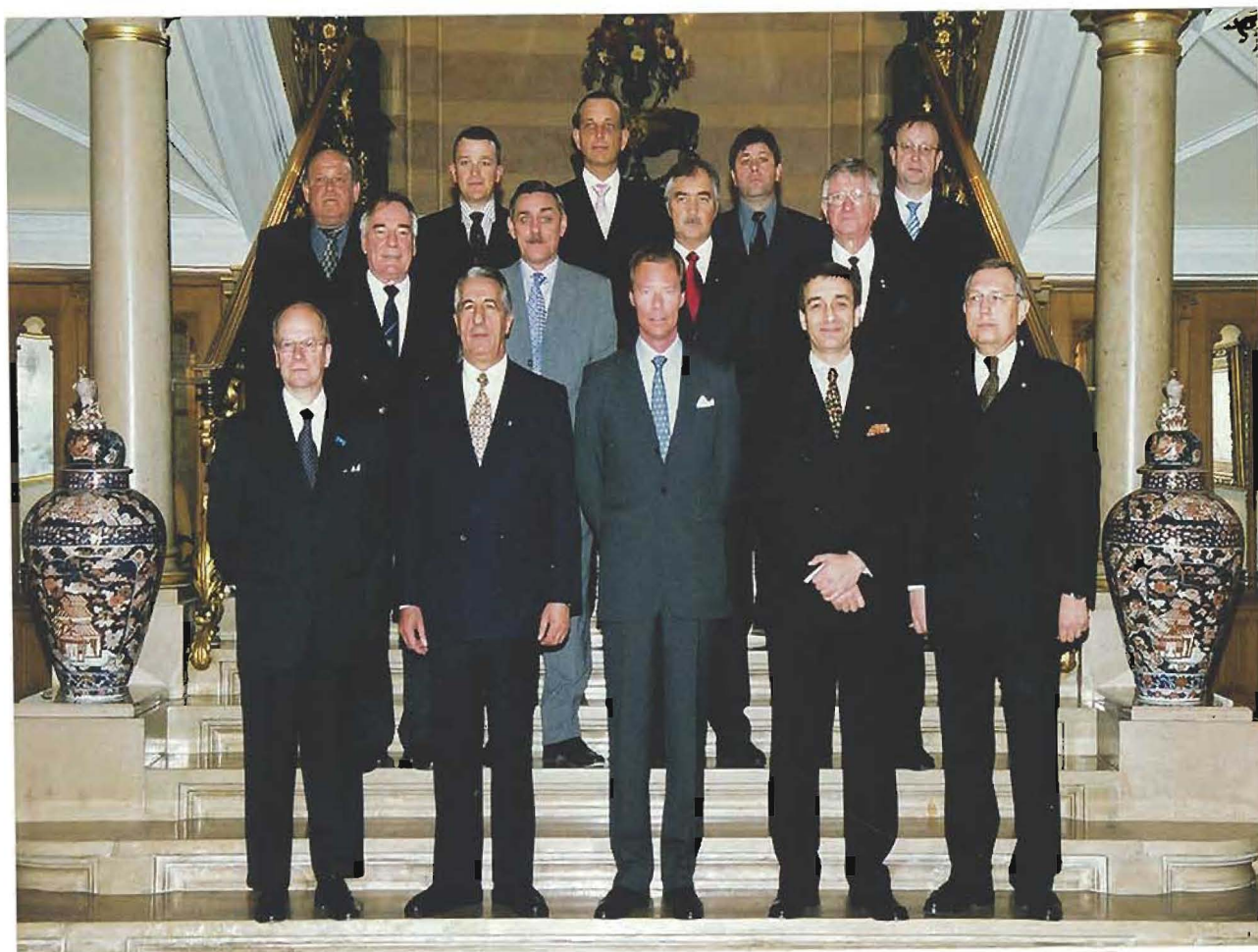
Visit in 1993 of the PEB and members of the Luxembourg National Board to the Ducal Palace in Luxembourg City. Grand Duke Henri is pictured front centre