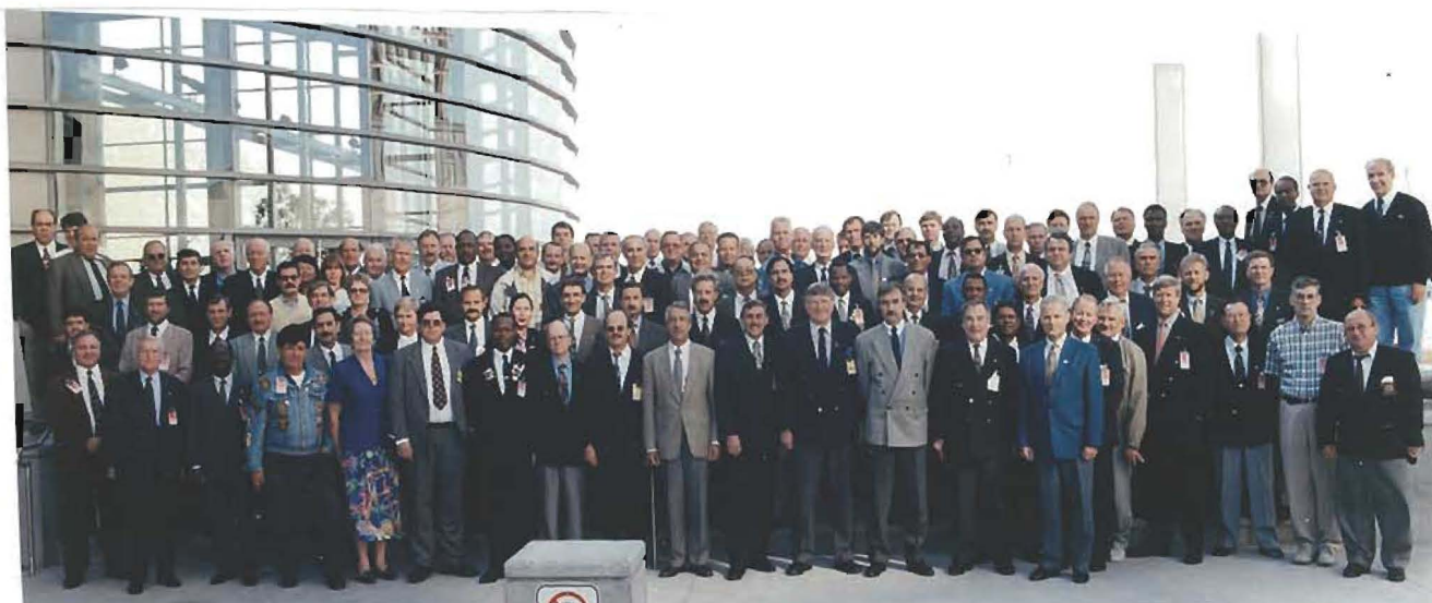
PEB members, national delegates and observers during the XV World Congress in Quebec, Canada in 1997