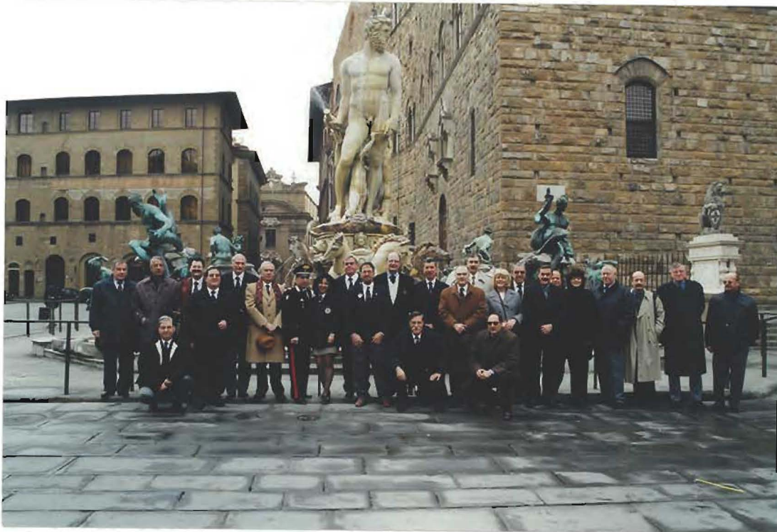
The PEB pictured with Italian IPA friends on the Main Square in Florence Following a PEB Meeting in the City in the late 1990's. As a tribute to the visit A special exhibition and display by various police units was organised