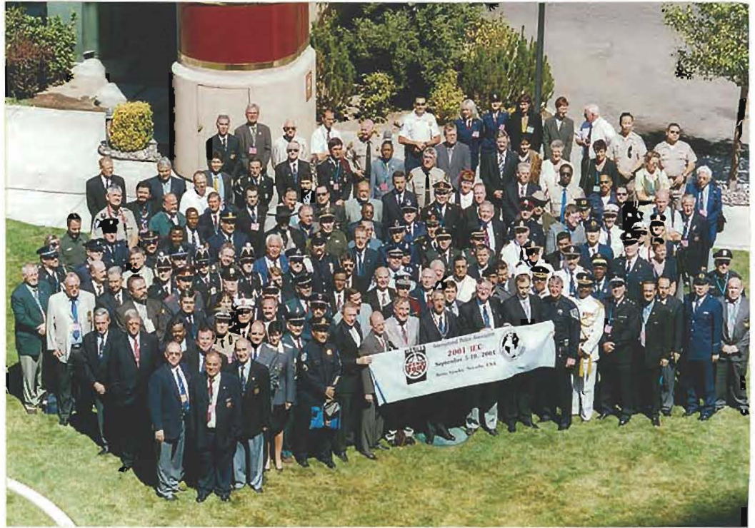
PEB members with national delegates and observers at the 30 th IEC Conference held in Reno in 2001