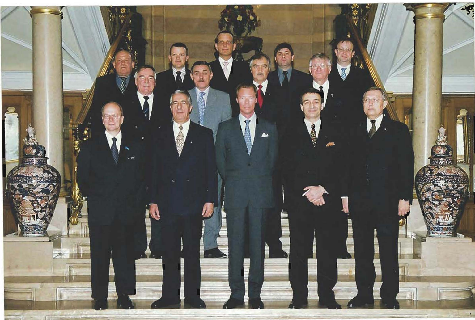
Visit in 1993 of the PEB and members of the Luxembourg National Board to the Ducal Palace in Luxembourg City. Grand Duke Henri is pictured front centre