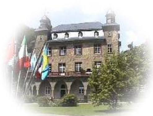
IBZ Gimborn Castle - the IPA's educational establishment

Further information is available by downloading the accompanying document