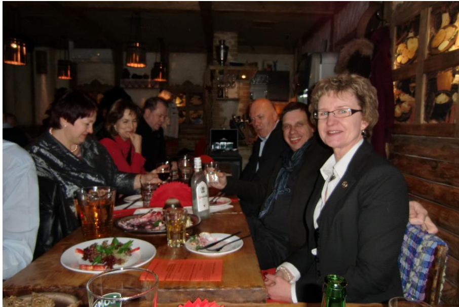
Some of the NEF delegates at dinner in central Warsaw after the meeting.