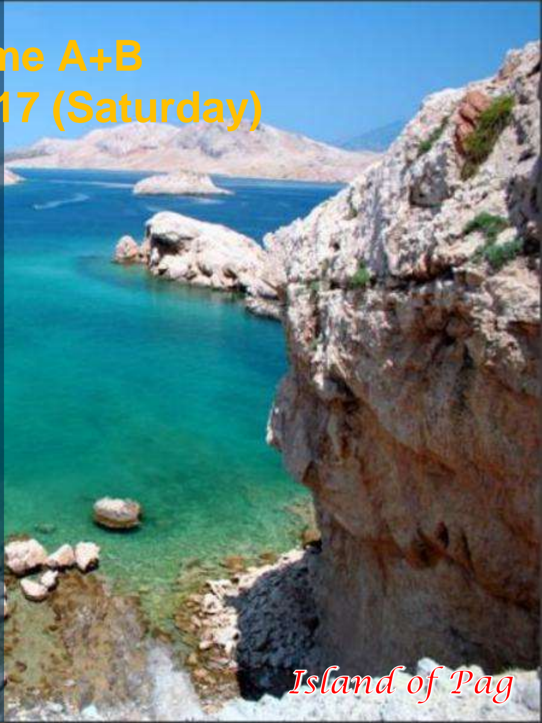
Island of Pag