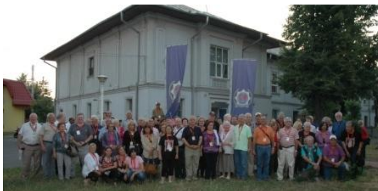
The Friendship Week members outside IPA office, Bucharest.

The Friendship Week was declared by all participants to be one of the best in recent years. It started with a tour of sights in Bucharest including the massive parliament building. An alternative visit to a folk park was offered to those who had already seen the parliament during the IEC social programme. The IPA members from 11 countries and 4 continents then travelled through majestic countryside to the Alpin hotel in the ski resort of Brasov. Tours included a visit to Vlad Dracul's castle in Bran, the royal palaces in Peles, the superb clock tower and the mayor's parlour in Sighisoara, where the group were joined by the Hollywood film star, Harvey Keitel, who was filming in the city. Well done to IPA Romania.